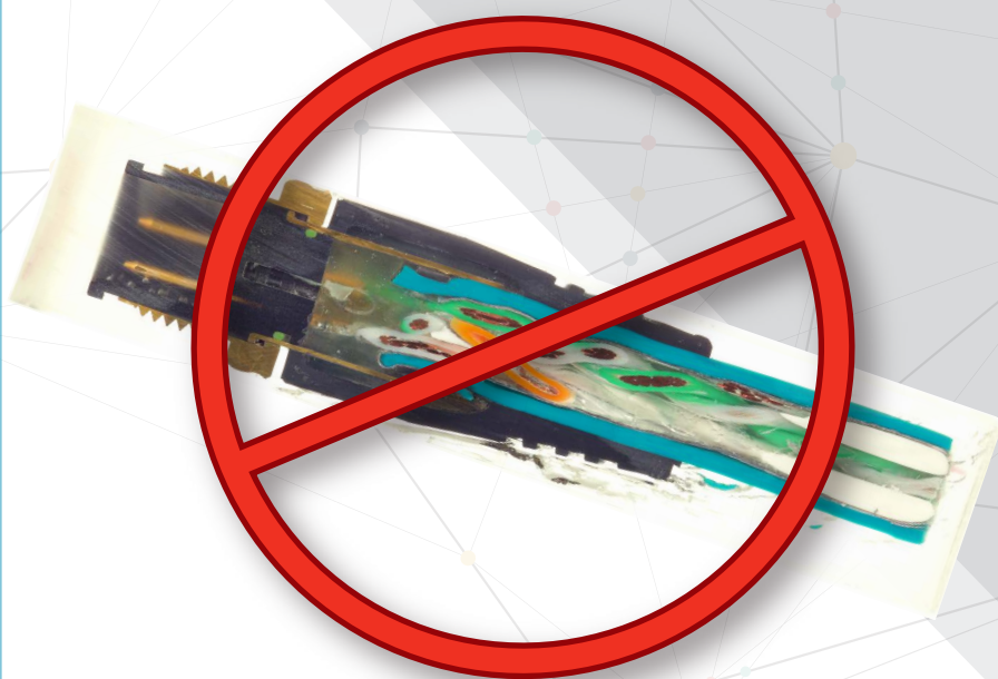
Competitor product shown

Always receive best in class performance.